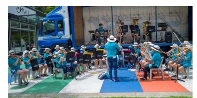
Our Development Band