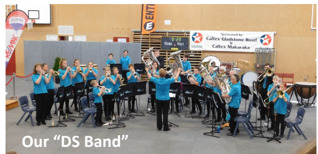
Our “DS Band”