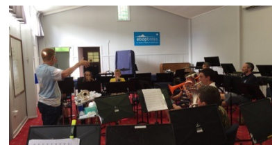
Our new Learner Group